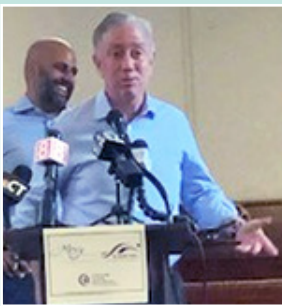
The Governor announced the release of the $5 million from the state's Federal Cuts Responses Fund at a news conference

held at Mercy Housing's St. Elizabeth House in May. The funds will be dispersed to homelessness diversion programs across the state.